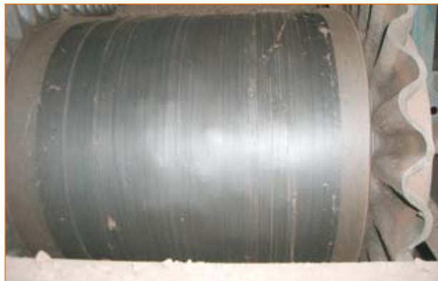
After installation of the modified belt cleaners, the carryback on the weighfeeder belts was controlled.

Pre-Cleaner incorporates a one-pin replacement system allowing fast, easy, no-tool blade service.