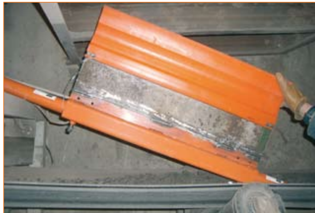
To solve the problem, Martin Engineering provided belt cleaners with a specially-modified mainframe.