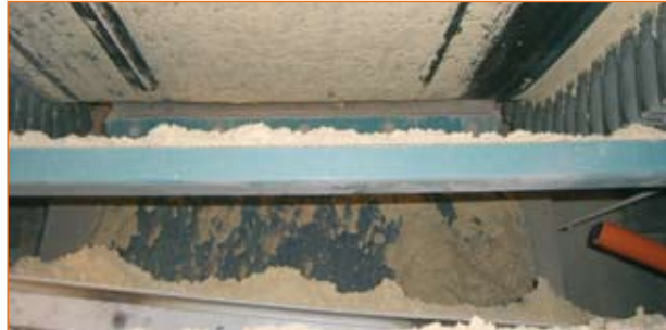
Carryback was a problem due to difficulties in cleaning the weighfeeder belts.