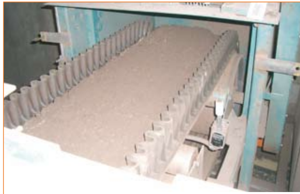
Weighfeeders at GCC of America Inc., Dacotah plant use corrugated sidewall belts.

This belt cleaner uses a rugged moulded urethane blade. The blade is designed with the patented CARP (Constant Angle Radial Pressure) blade design that maintains consistent cleaning performance through all stages of blade life. When blade replacement is required, the QC™ #1 Heavy Duty